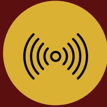
Sensors & Motor Integration