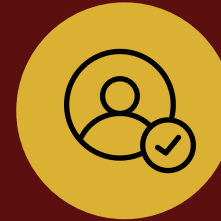
Clinical & End-User Validations