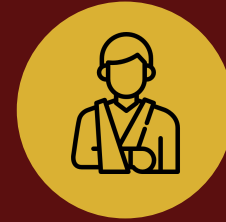
Rehabilitation & Injury Prevention